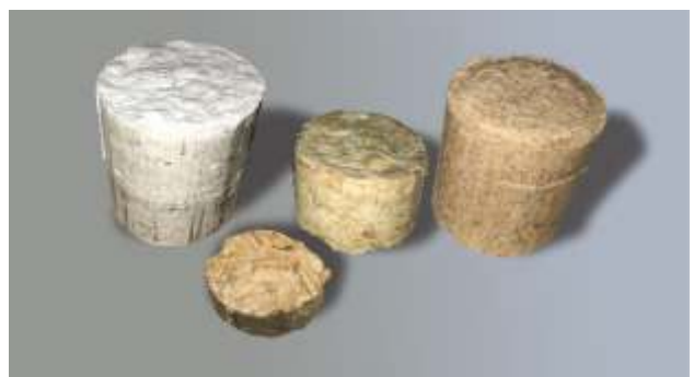
Briquet-Ø=40 mm Styrofoam / coarse wood / soft and hardwood